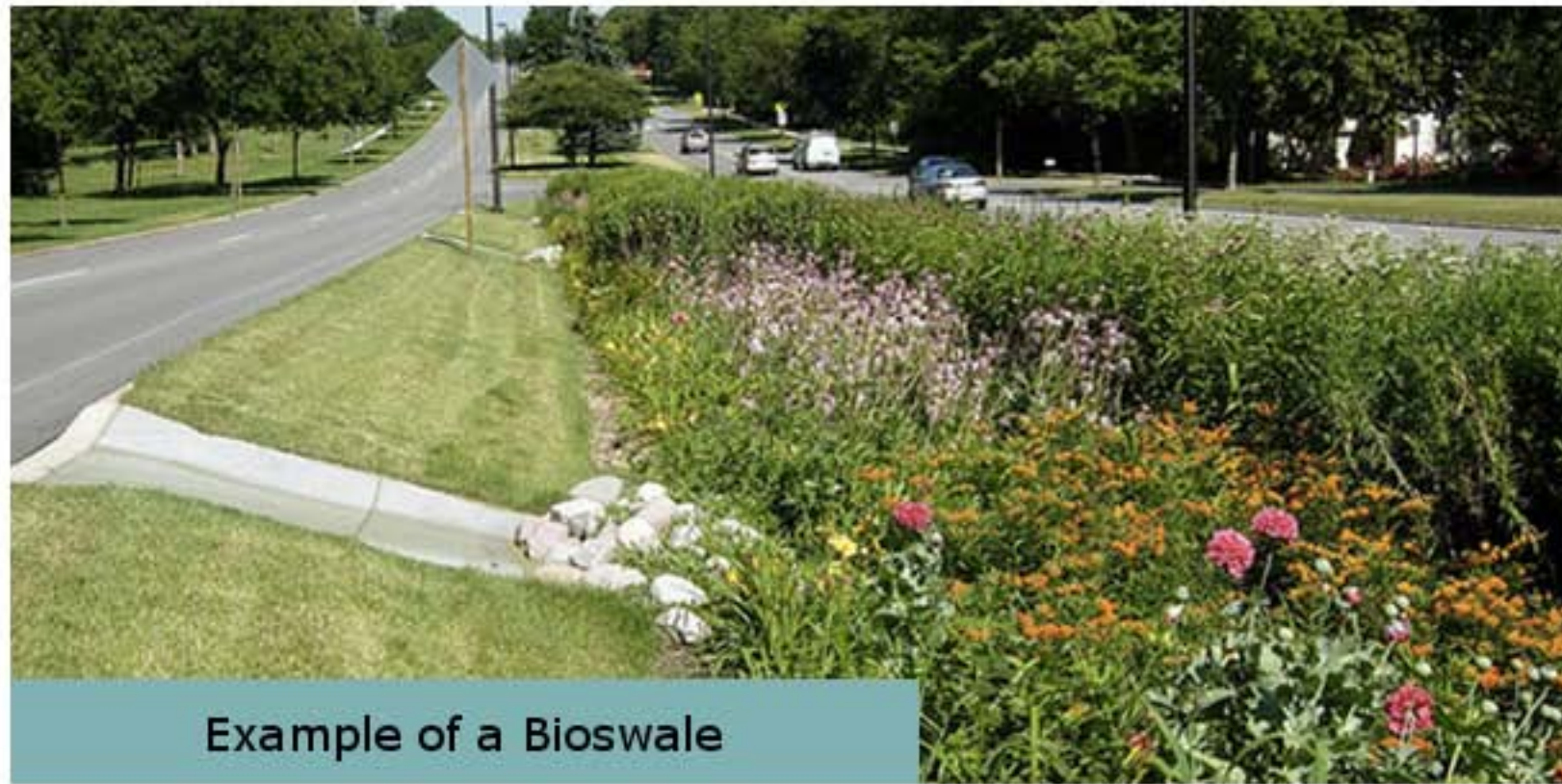
Example of a Bioswale