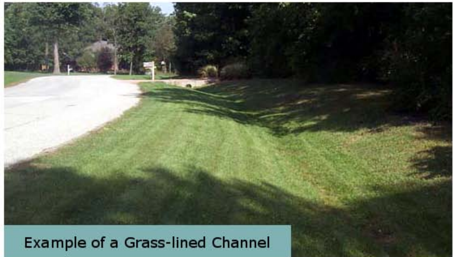
Example of a Grass-lined Channel