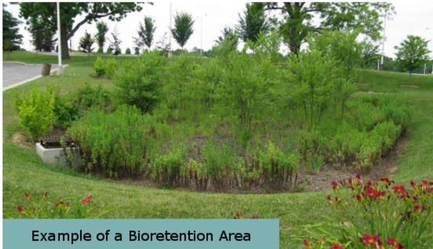
Example of a Bioretention Area