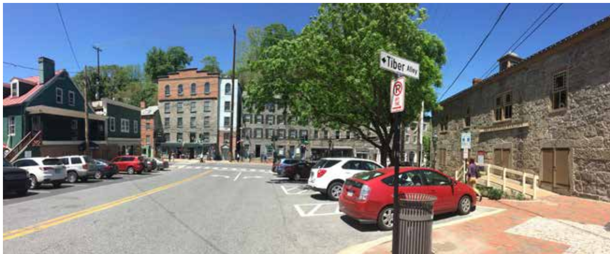
Figure 132: Spatial Breadth of Maryland Avenue