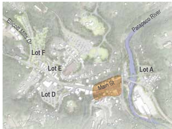
Figure 133: Key Plan — Lower Main

an elevation higher than the Tiber Branch (parallel to St. Paul Street) before dropping to turn a water wheel. The Tiber meanwhile, was channelized with side walls