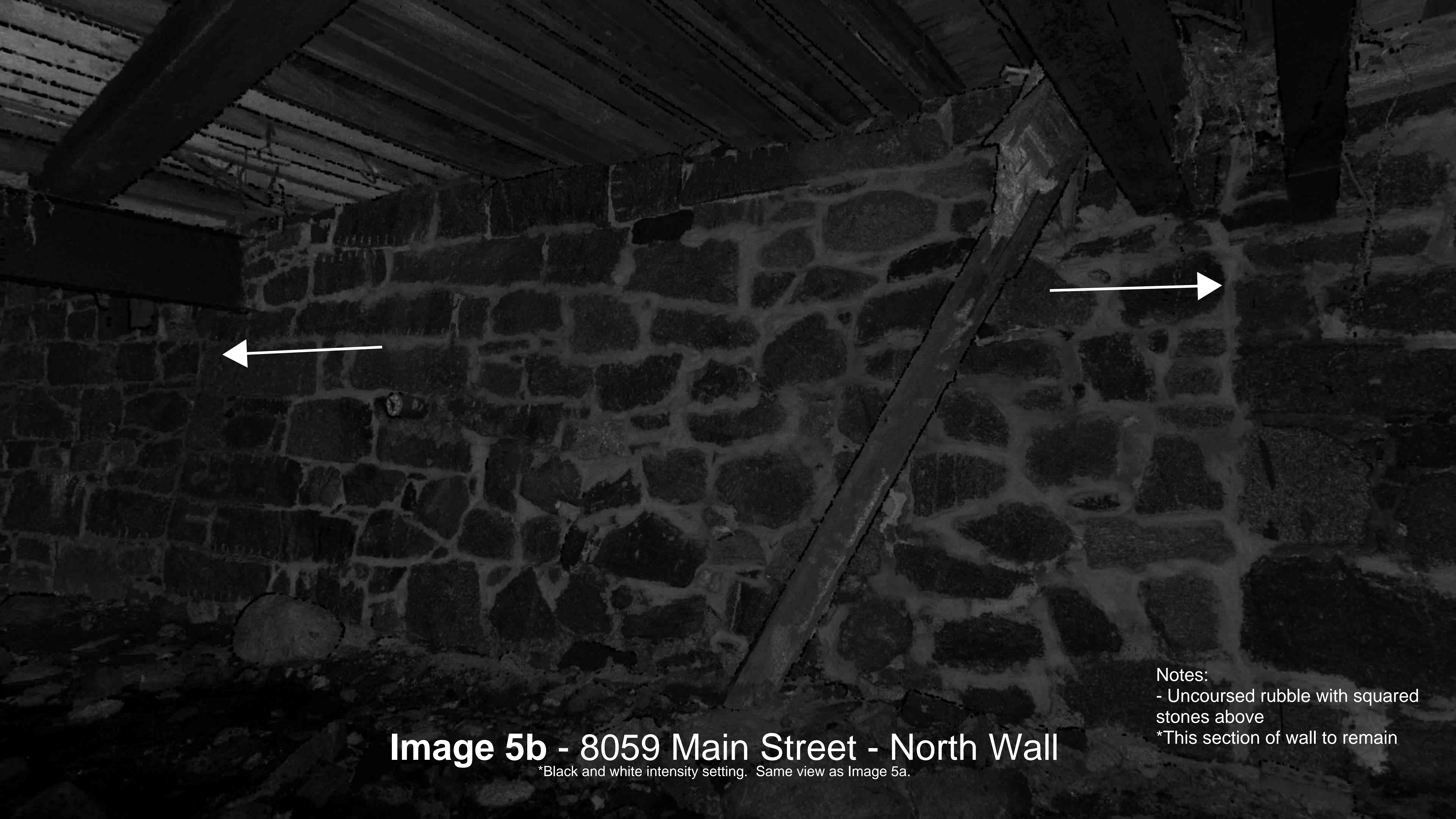
Image 5b - 8059 Main Street - North Wall

*Black and white intensity setting. Same view as Image 5a.