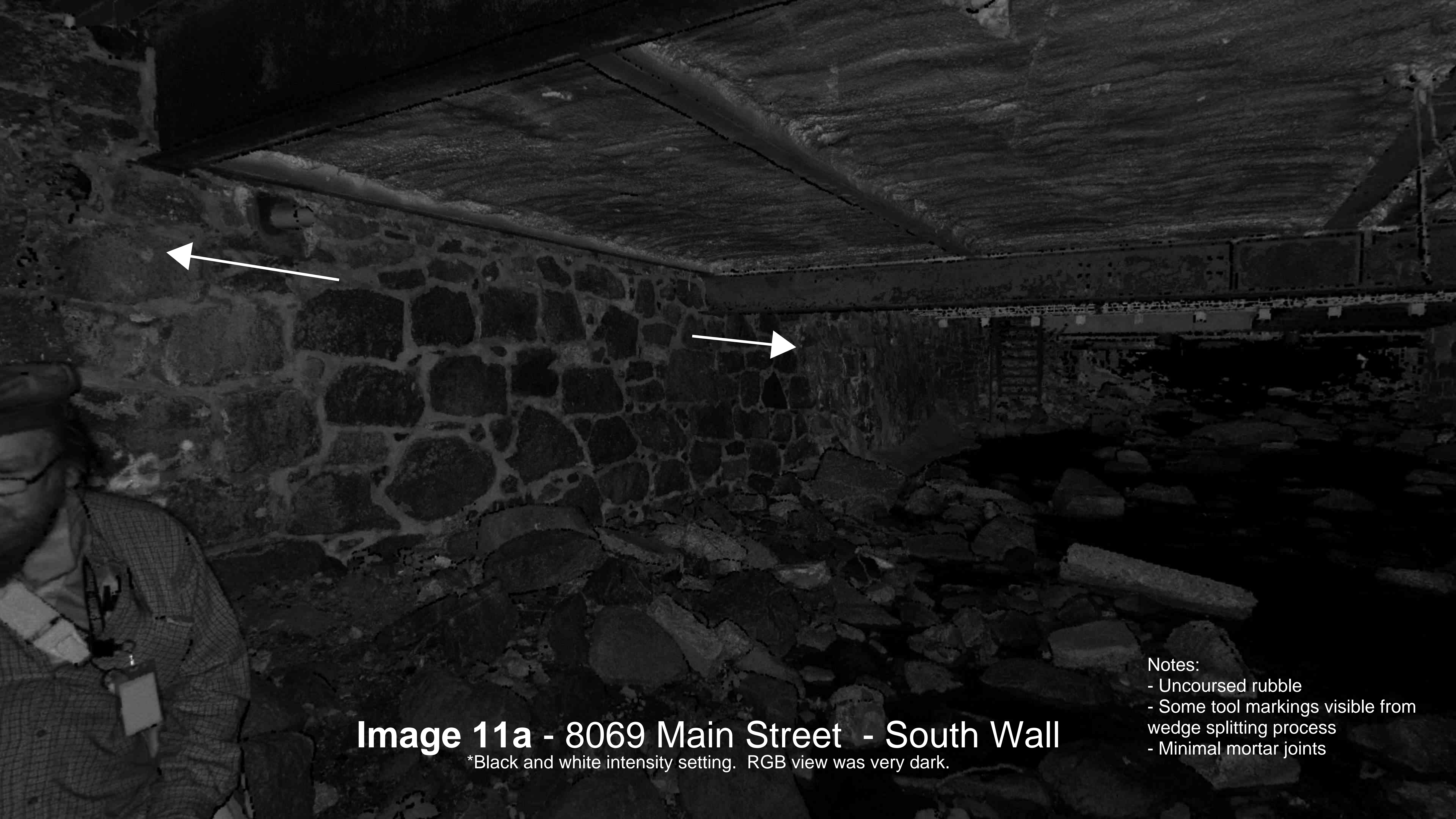
Image 11a - 8069 Main Street - South Wall

*Black and white intensity setting. RGB view was very dark.