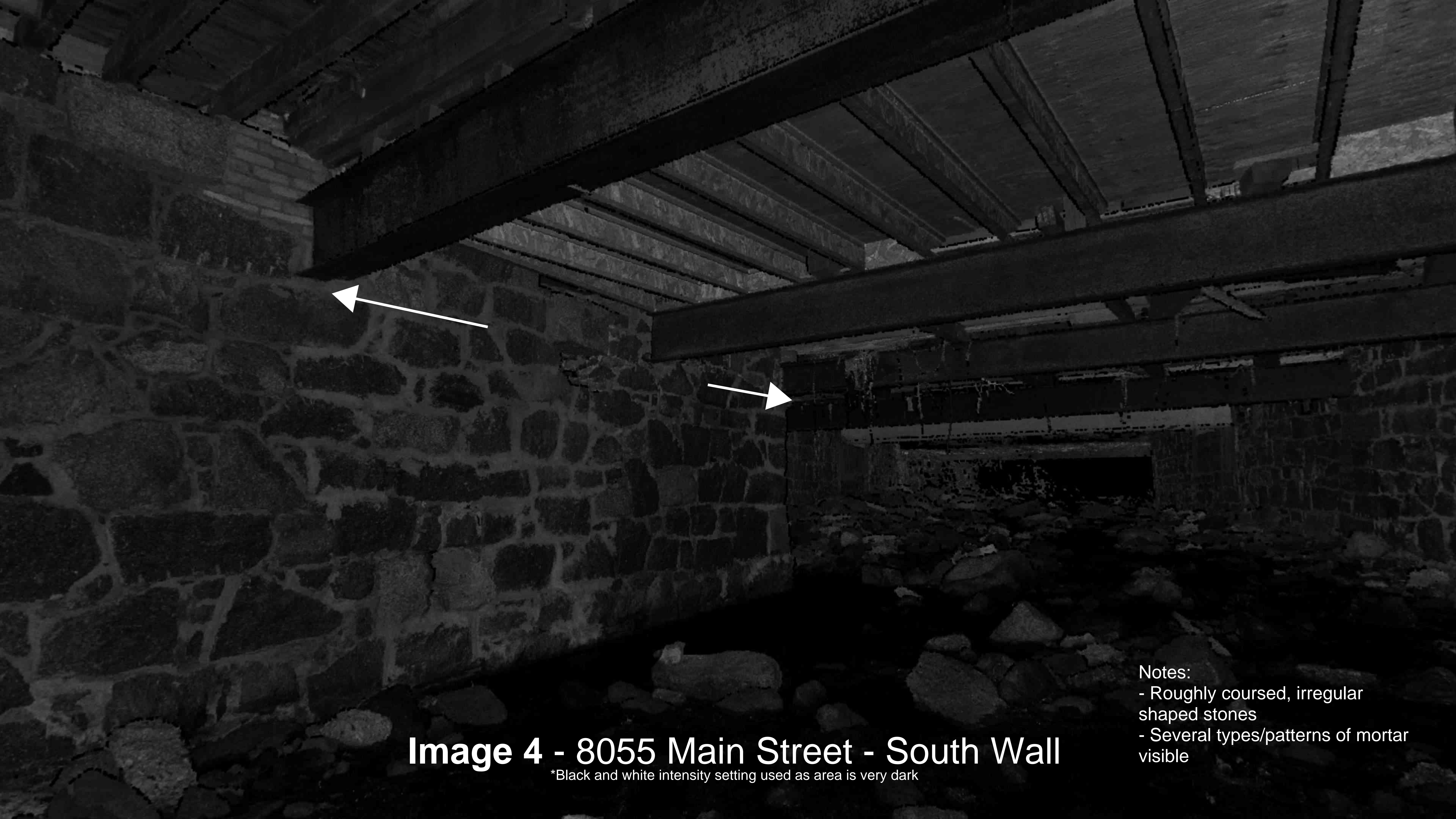
Image 4 - 8055 Main Street - South Wall

*Black and white intensity setting used as area is very dark