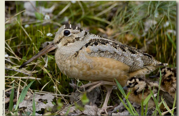
Woodcock and Chicks

Courtship activities occur at dusk and dawn from mid February until late April. The male woodcock's display begins on the ground with a series of nasal "peent" calls. He then bursts into flight, spiraling above the singing ground with twittering wings, and then chirping as he descends in a zig-zag dive.