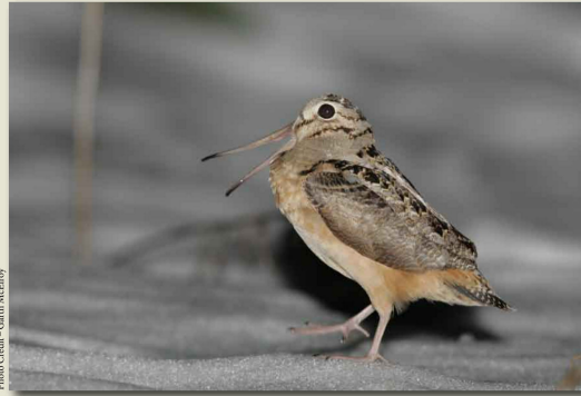
Woodcock Courtship