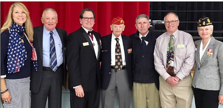
Second photo above, scouts honor veterans in Veterans Day parade; above right, veterans and community members greeting Honor Flight Veterans. Directly above, Vet-In-School at Clarksville Middle School.