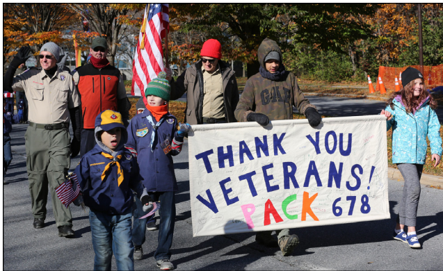
And, a somber salute in honor of those who gave all.