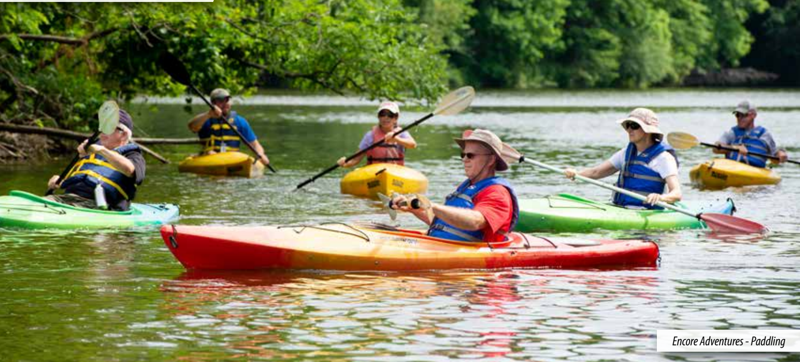
Encore Adventures - Paddling