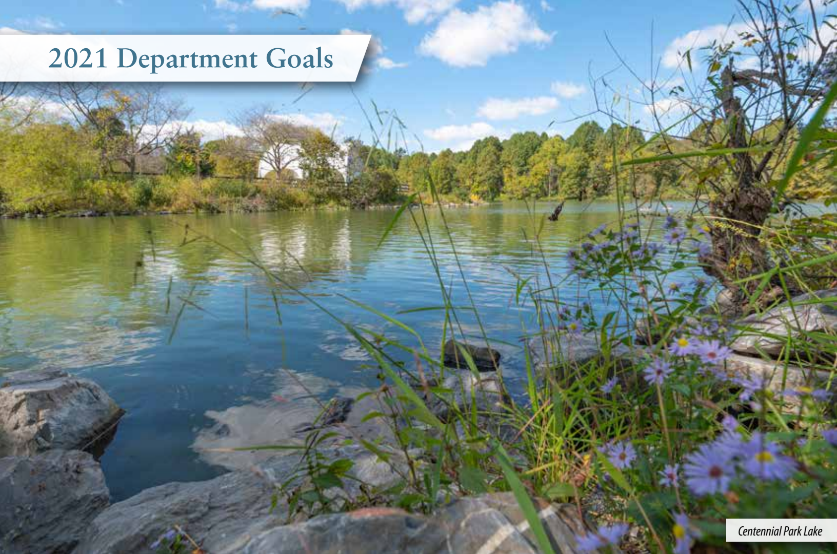
Centennial Park Lake