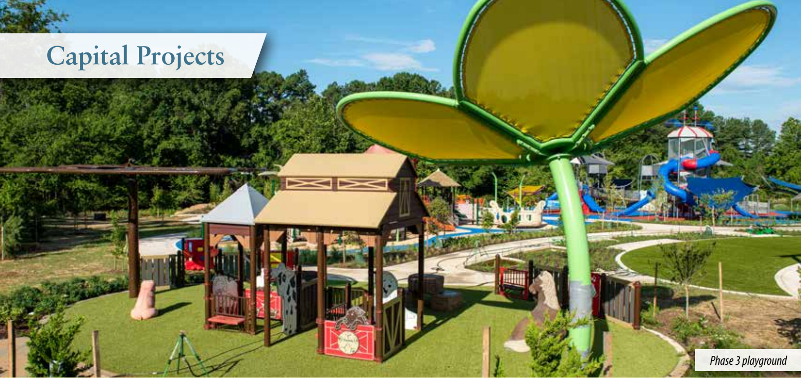
Phase 3 playground