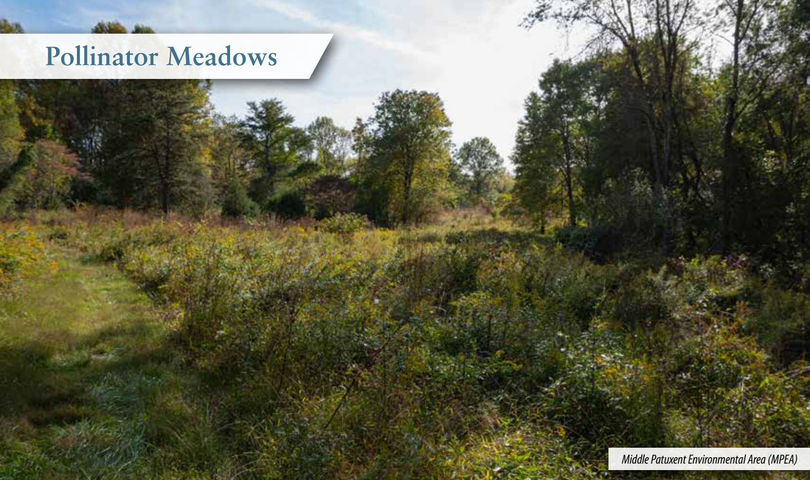
Middle Patuxent Environmental Area (MPEA)