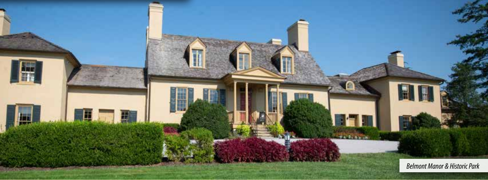
Belmont Manor & Historic Park