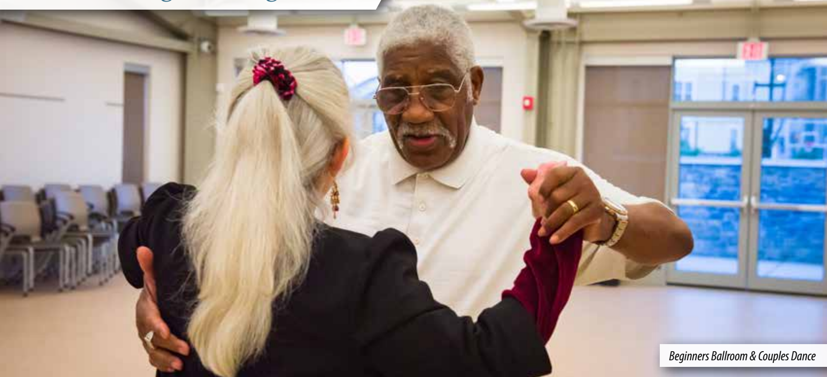
Beginners Ballroom & Couples Dance