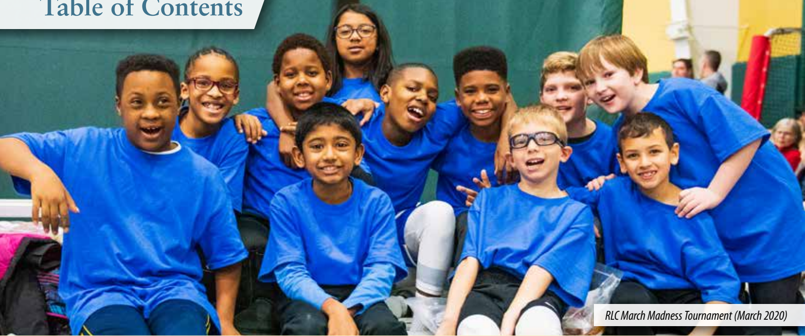
RLC March Madness Tournament (March 2020)