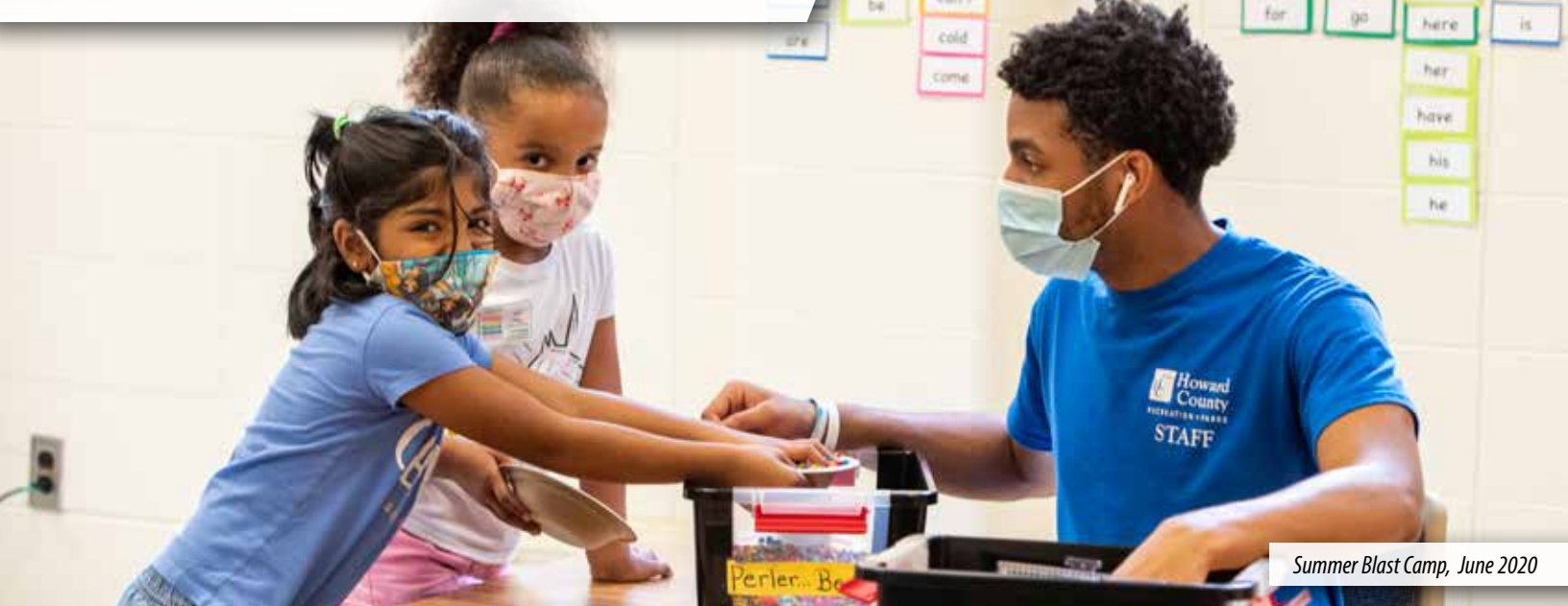
Summer Blast Camp, June 2020