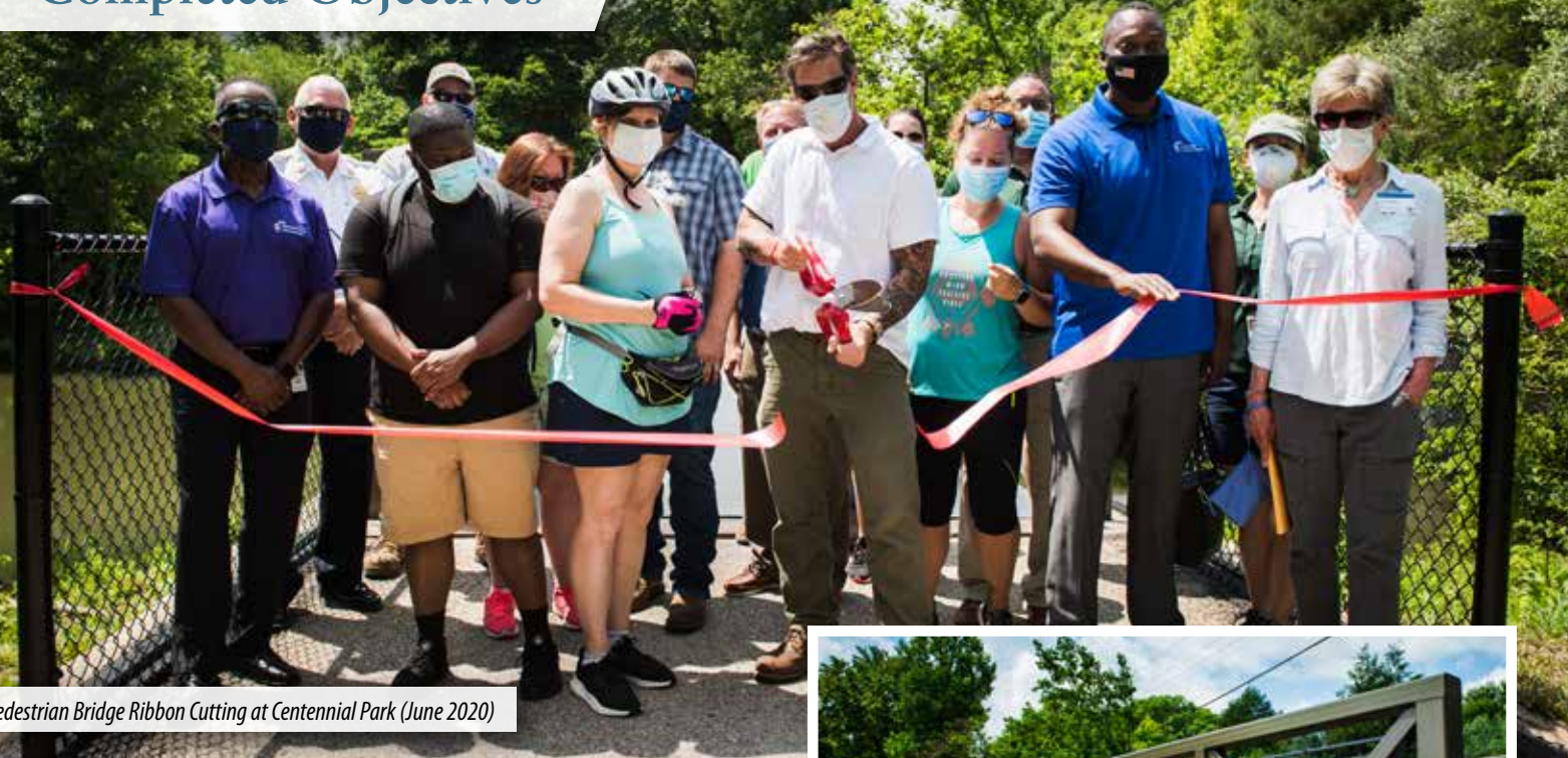
Pedestrian Bridge Ribbon Cutting at Centennial Park (June 2020)