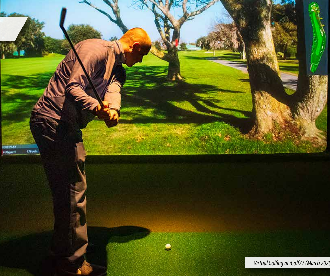
Virtual Golfing at iGolf72 (March 2020)