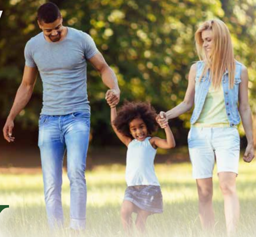
Promo Image for Park RX Program