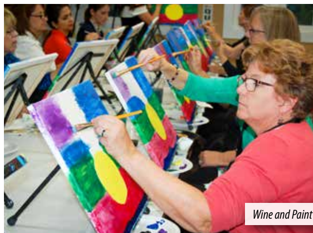
Wine and Paint