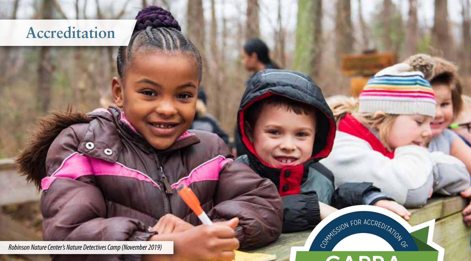
Robinson Nature Center's Nature Detectives Camp (November 2019)