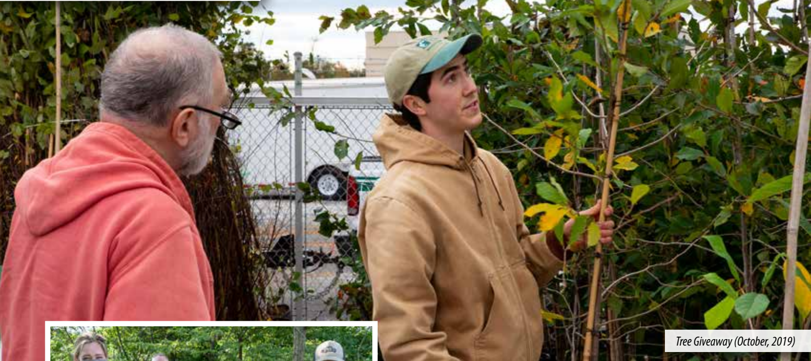
Tree Giveaway (October, 2019)