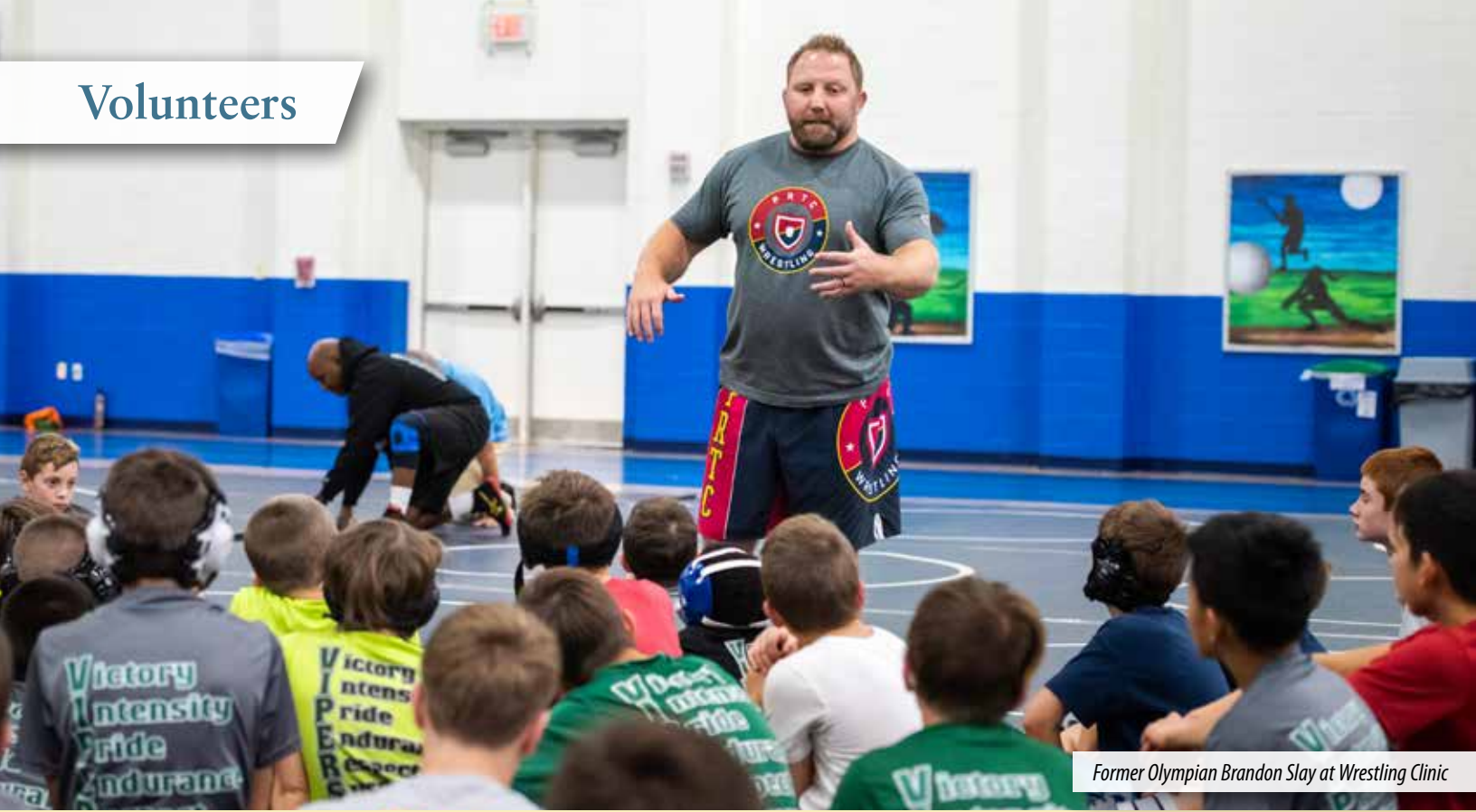
Former Olympian Brandon Slay at Wrestling Clinic