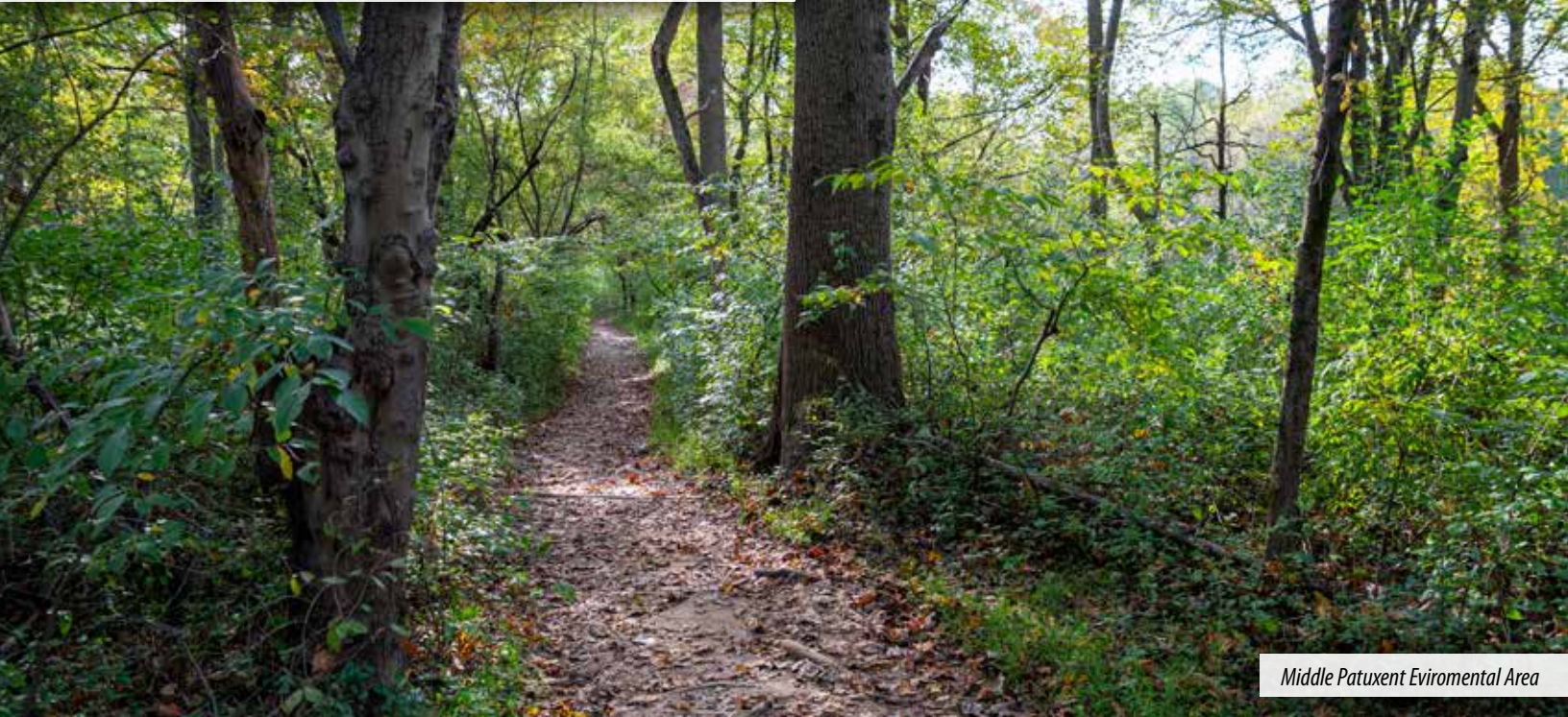
Middle Patuxent Environmental Area