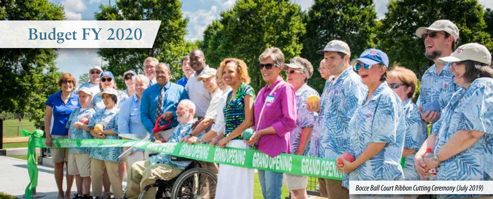
Bocce Ball Court Ribbon Cutting Ceremony (July 2019)