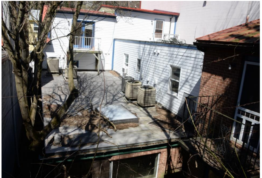
Figure 12 - Rear of 8109-8111, 8113 Main Street