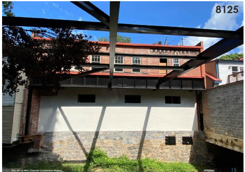
Figure 13 - Rear of 8125 Main Street.

A second approach would be to install brick masonry, complementary to the existing brick visible on the 2nd floor, on the lower level as well. With either option, clerestory windows are proposed for installation. The placement was developed in response to the 3-bay rhythm of the front façade.”