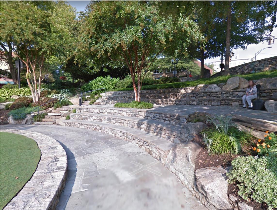
Figure 19 – Example of terracing and stonework at Falls Park on the Reedy, Greenville, SC

Alternate arrangement of the ramp switchbacks and terracing could allow for more usable parkland, which could include incorporation of picnic tables, terracing, benches and usable lawn. This would allow more gathering space during emergency events and more space for passive recreational opportunities.