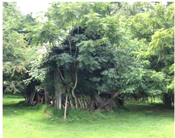
Figure 5 - Outbuilding to be demolished.