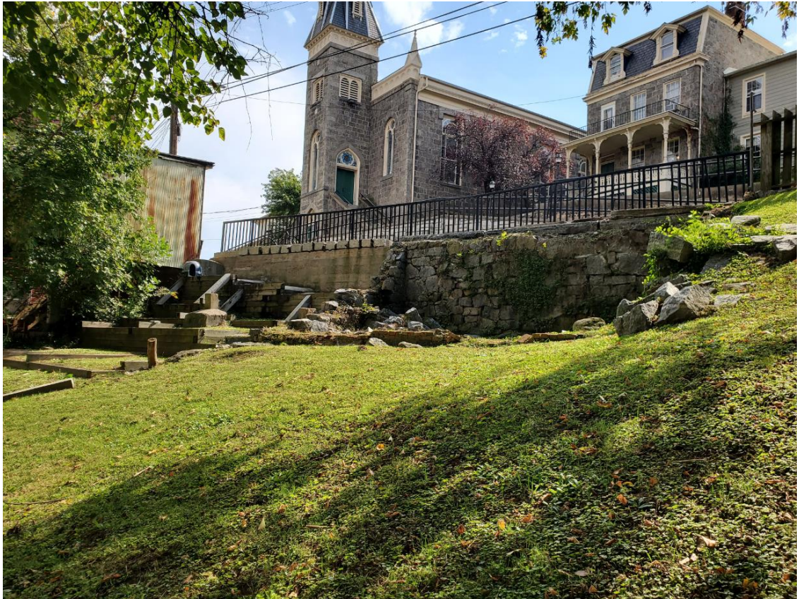
Figure 17 - View looking toward foundation ruins and St. Paul Street