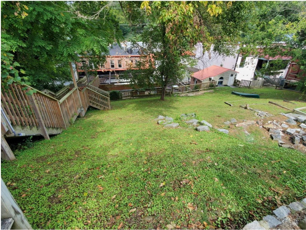
Figure 16 - Pressure treated walkway and view of proposed park area.