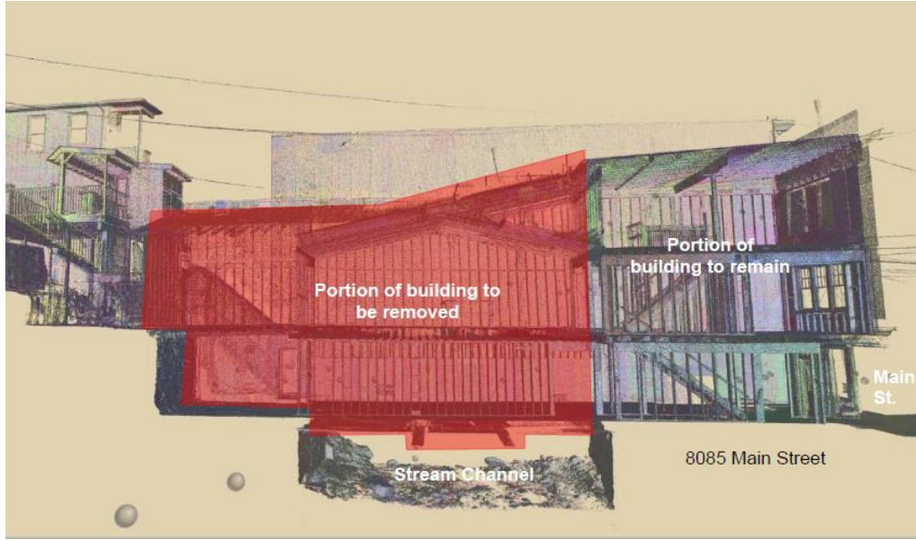
Figure 6 - Proposed area of demolition at 8085 Main Street