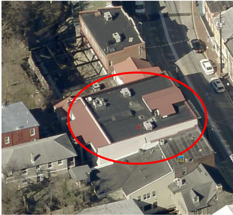
Figure 11 - Aerial view of 8095 Main Street