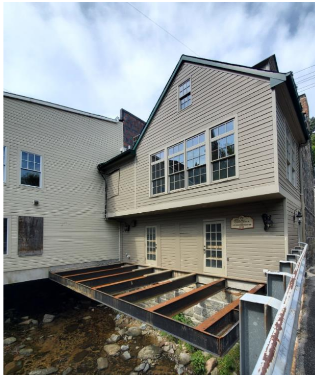
Figure 9 - Rear 8081 Main Street