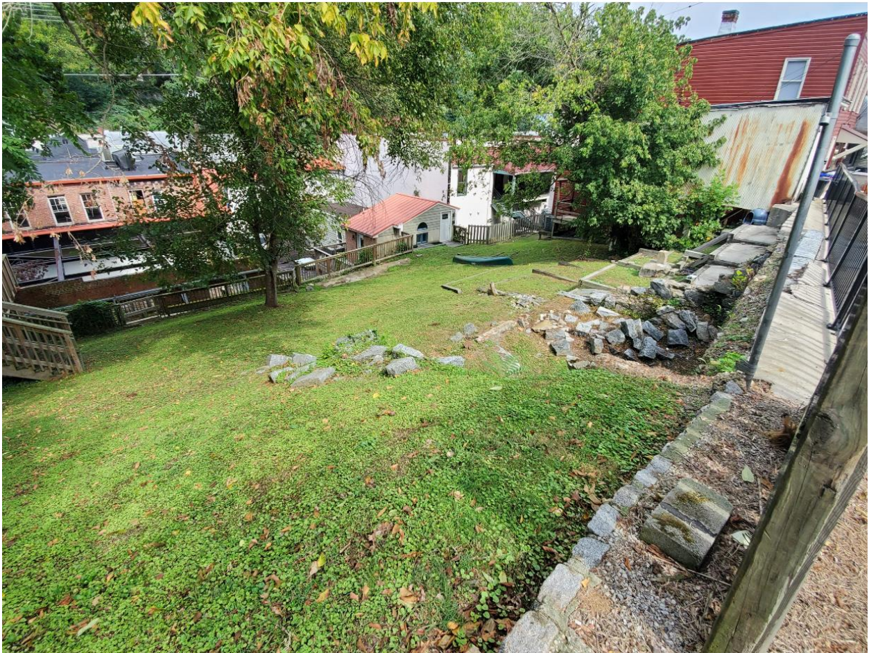
Figure 15 - Looking at park area from St. Paul Street