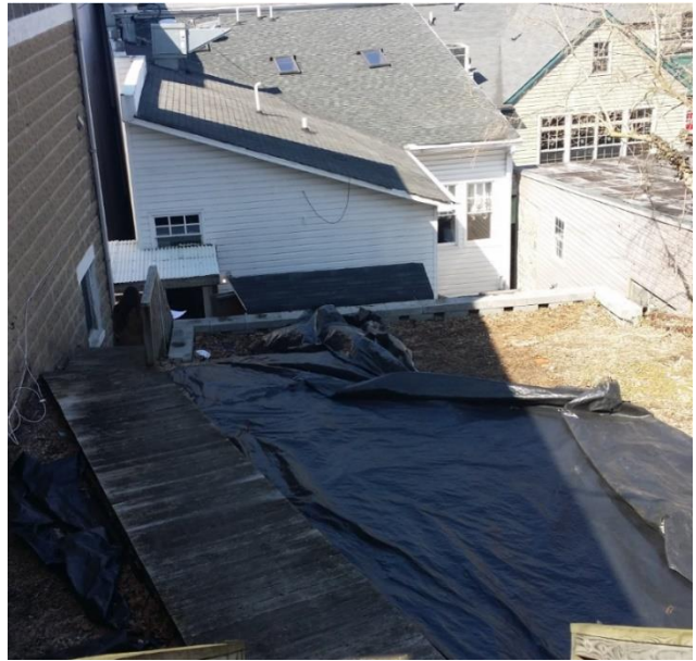
Figure 10 - Rear of 8085/Portalli's in 2012, prior to construction of rear deck and bar.