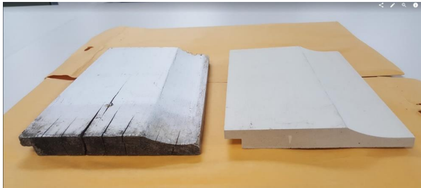
Figure 18 – Older wood siding (left) compared to Boral siding (right)