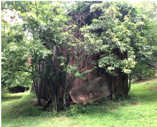
Figure 4 - Outbuilding to be demolished.