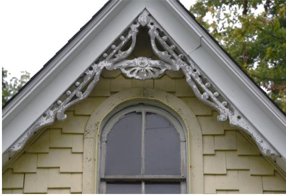
Figure 2 - Vergerboard details and arched window.