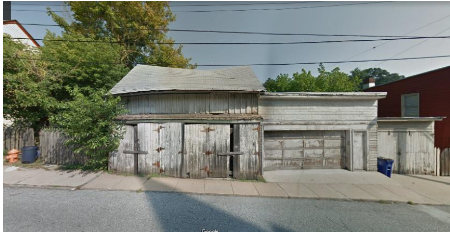
Figure 14 - Previously existing garages.