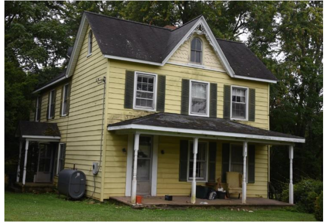
Figure 1 - Building located at 13883 Triadelphia Road.

Scope of Work: The Applicant proposes to demolish all existing structures, including the historic house and a barn and construct a new principle dwelling. In addition to the barn, there are ruins of a few outbuildings around the property. All of these structures will be demolished.