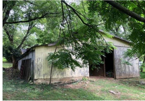
Figure 3 - Outbuilding to be demolished.