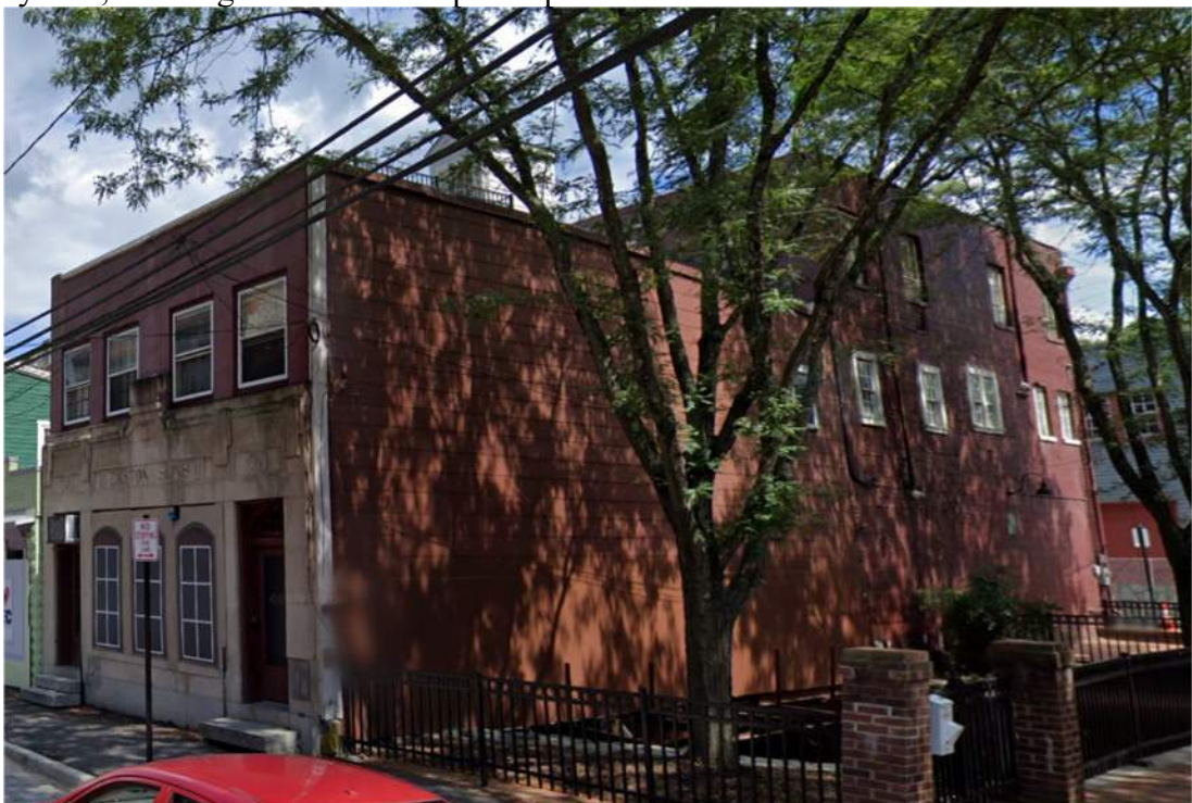
Image 8095.1 – Image of 8059 Main Street, windows in rear block wall

system, utilizing aluminum composite panels.