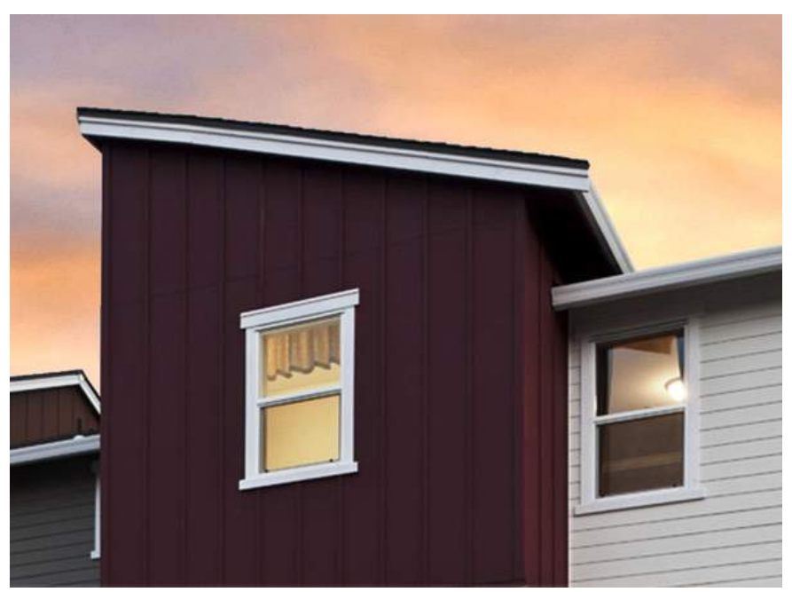
Image 8125.1 – Board and Baton composite siding, painted dark in color.

A second approach would be to install brick masonry, complementary to the existing brick visible on the 2^{nd} floor, on the lower level as well.