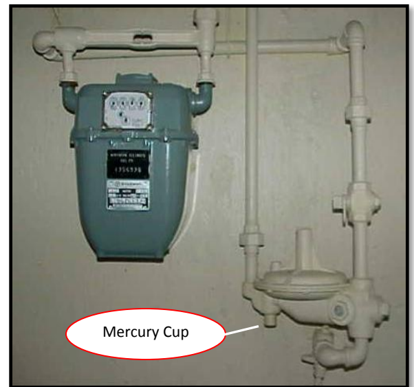
A gas pressure regulator, adjacent to a gas meter, with the location of the mercury cup identified.

schedule at least two weeks in advance of