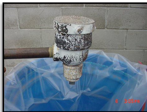
World War II-era mercury-containing gas pressure regulator.

Recommended Management: Mercury-containing gas pressure regulators should be removed only by qualified gas company personnel. Local government entities planning to demolish residential buildings (or anyone planning to demolish any building) having gas pressure regulators or other gas equipment should inform the local gas company of their proposed demolition