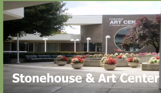
Stonehouse & Art Center