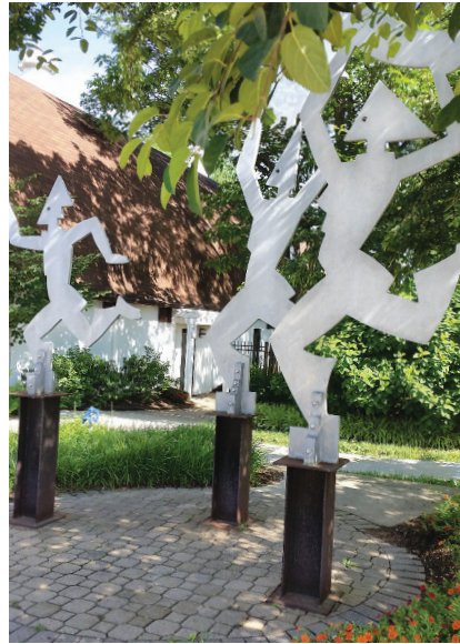
Sculptures dance across the courtyard outside the Other Barn at Oakland Mills Village Center.

Smaller ground-floor rooms, like The Smithy, host village meetings, including the Oakland Mills Board of Directors and the Oakland Mills Resident Architecture committee (RAC). Everything from plant sales to village elections takes place in The Other Barn, which is truly the hub of the Oakland Mills community.