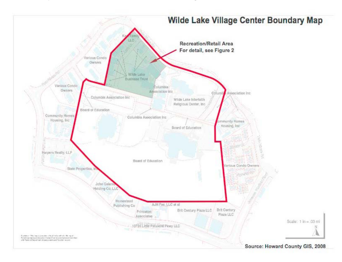
Figure 1. Wilde Lake Village Center Boundaries