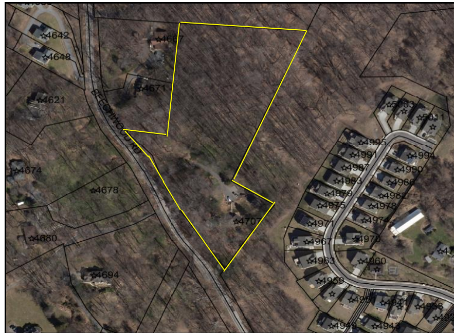
The Penkusky Property