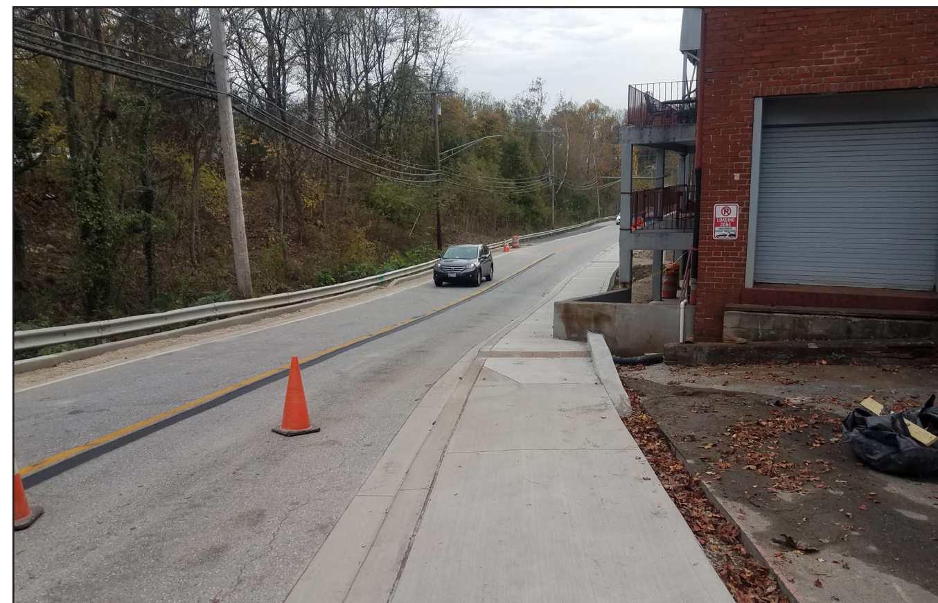
Foundry Street Pathway