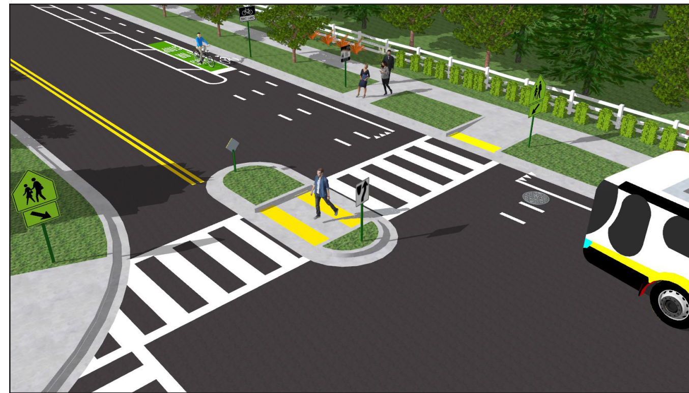
Oakland Mills Road