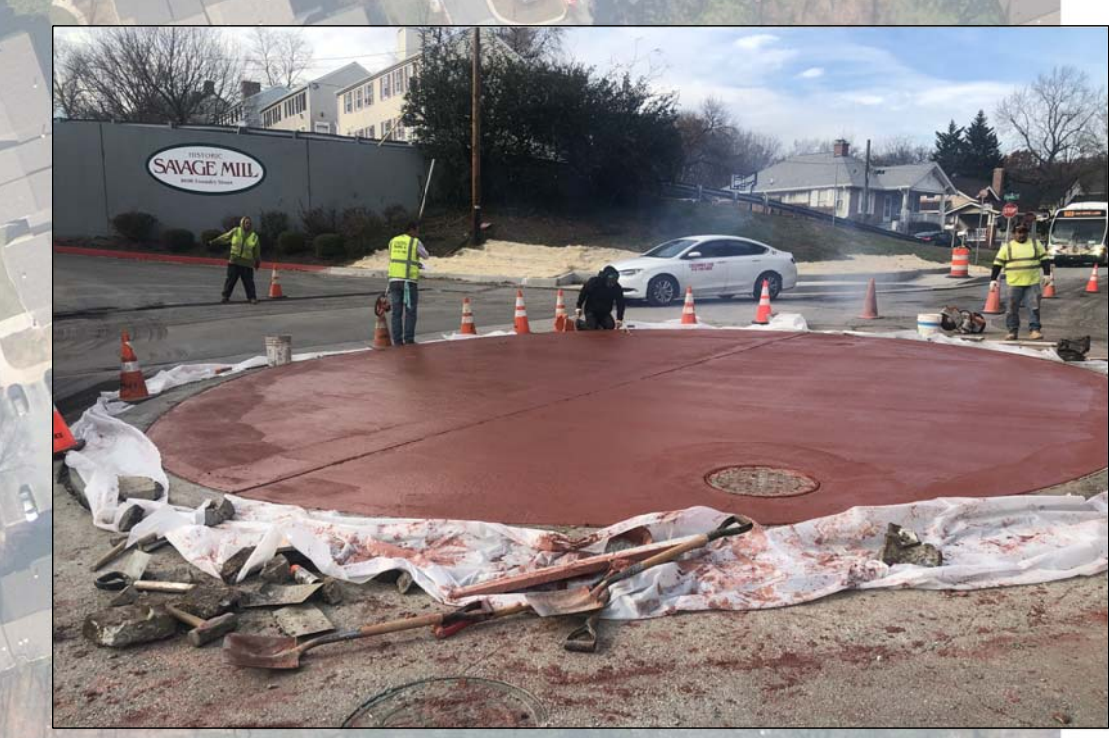
New 30' inscribed roundabout installation