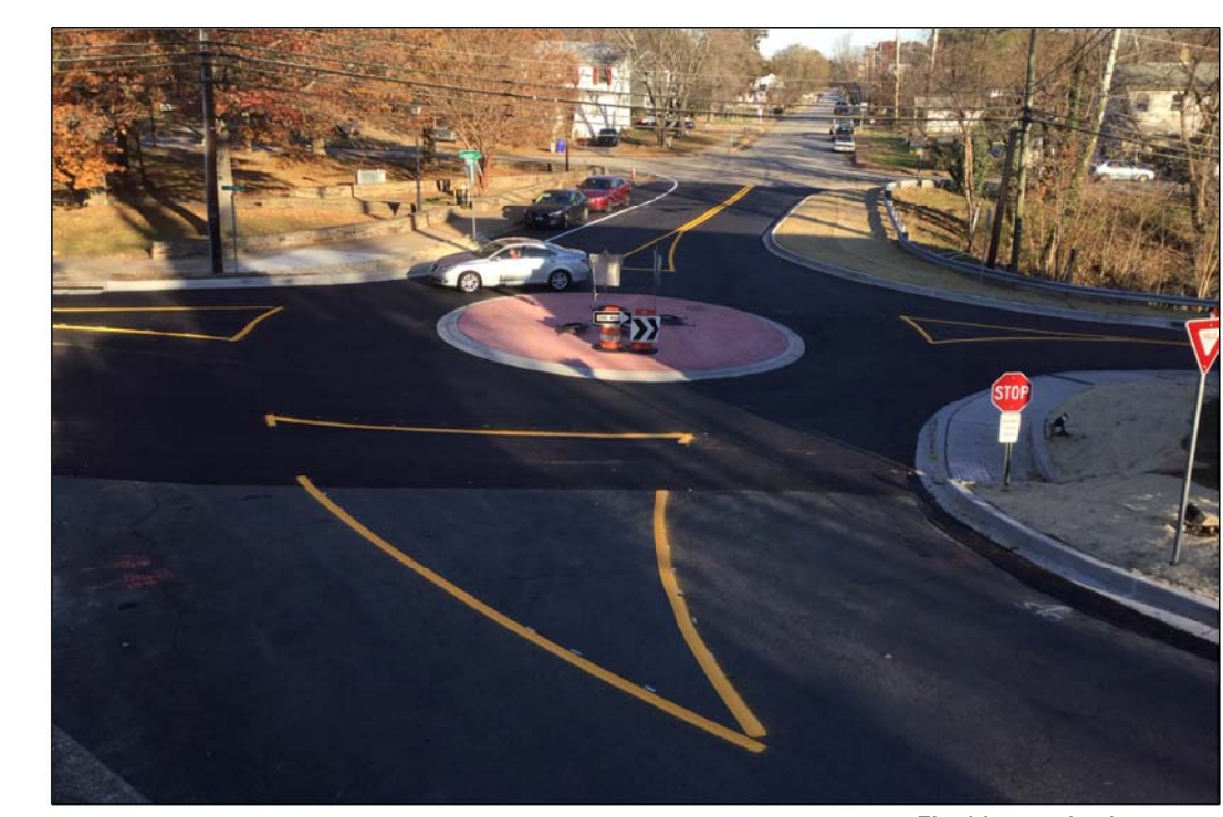
Final layout looking east