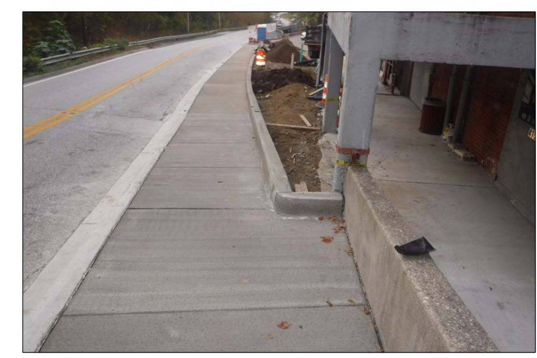
New sidewalk along Foundry St. looking south