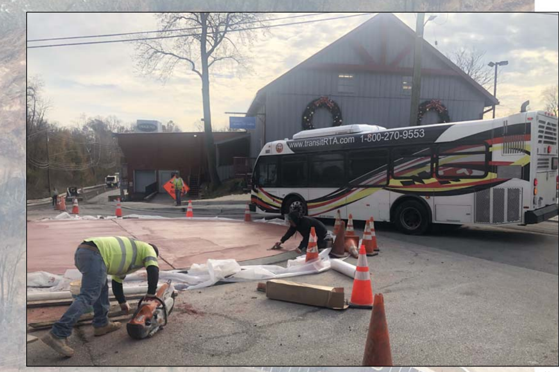
Saw cutting while maintaining traffic