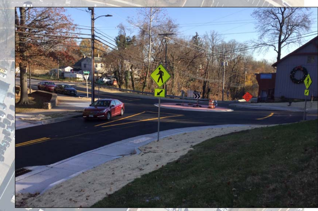
Final layout looking south with ped crossing