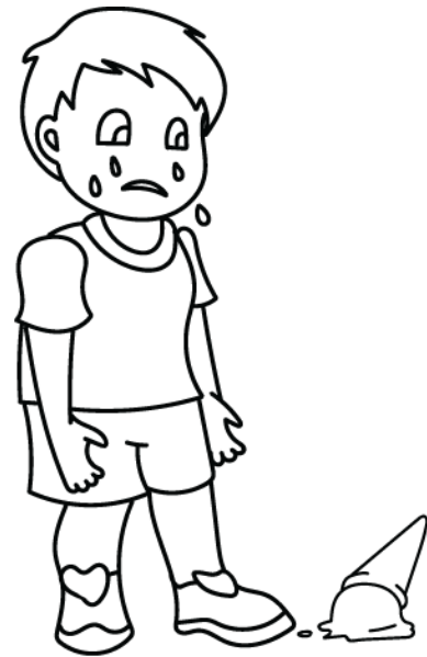
You drop your ice cream cone.