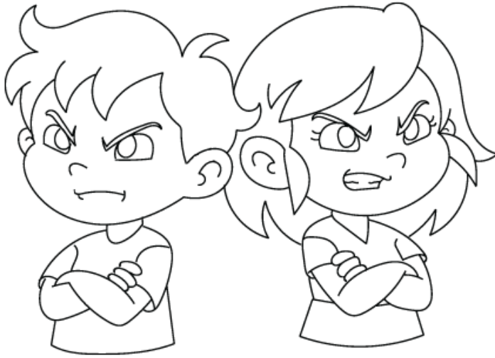
You are upset with your friend.