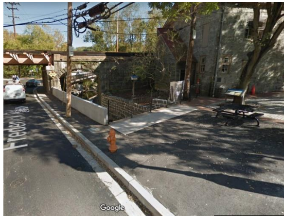
Figure 9 - Condition after 2016 flood