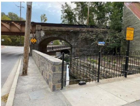
Figure 11 - Area of replacement parallel to Main Street

The area of proposed concrete sidewalk installation is shown below, in Figure 11 and 12.