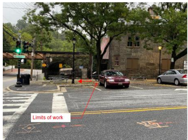
Figure 12 - Limits of work along Maryland Avenue