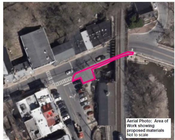
Attachment C: Proposed Plan and Details for Implementation of Concrete Sidewalks Howard County Department of Public Works | October 12, 2020